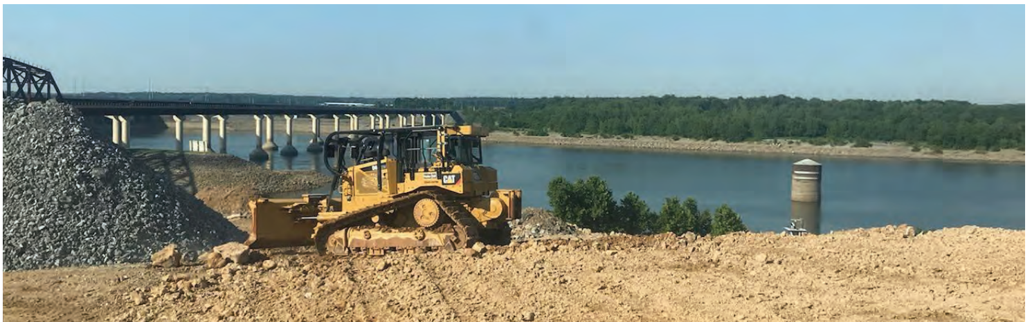
Heeter Geotechnical at Kentucky Dam