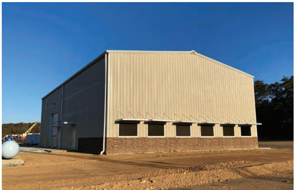
The new International Pipeline classroom and shop at the Boston Training Site.

In case members know of anyone interested in getting started in the apprentice program there are a few things that they will need to do. First, complete an application that you can receive at any of the district offices or the two training sites and must be picked up by the person applying for the program. After they have completed the application and gathered all the information needed, the application packet is held until the committee sees the need for more apprentices, which is usually held in spring/summer months of the year. Please keep in mind there will be a fee of $25 (check/money order – no cash/card accepted) that will be reimbursed after complete application has been received.