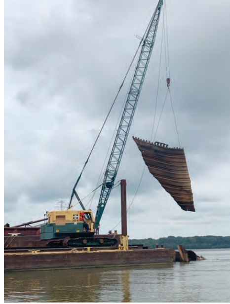
Southern Marine at the TVA Shawnee Steam Plant

In closing, we want to encourage all members to attend the monthly meetings held the first Tuesday of every month (except June and December) at the AFL-CIO building located at 1202 South 4th Street, Paducah, KY at 7:30 p.m. and remember to re-register every six months. We wish all our members a Safe and Happy Holiday Season and if we can be of any assistance, please call our office at 270-443-7766. ♦