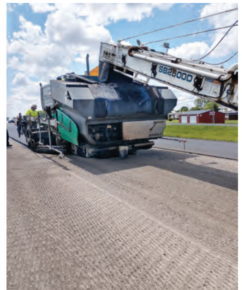
Milestone Contractors spray paving on Highway 31 in Bartholomew County.