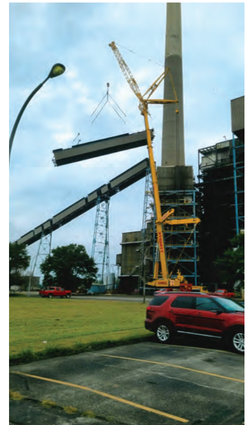
Sterett Crane assists Sterling Industrial with the demolition of OMU Coal plant conveyor in Owensboro, Kentucky

If we can be of any assistance, please call us at 1-270-826-2704.