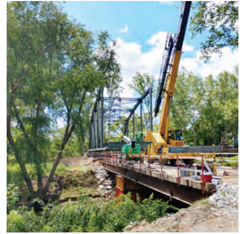
Walking bridge in Brown County State Park by Force Construction