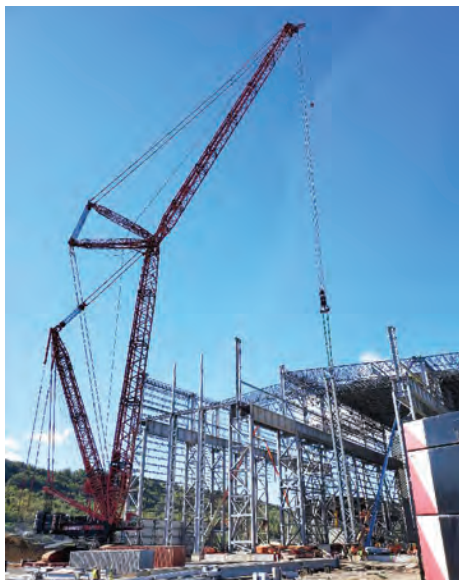
Mammoet Crane at Nucor Steel in Gallatin County, Kentucky

In closing, we want encourage all members to attend the monthly district meetings held in Louisville, KY on the 1st Tuesday and Elrod, IN on the 2nd Tuesday of the month (except in June and December). If we can be of any assistance, please feel free to give us a call at (502) 636-1476.