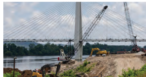
Work on the Russell viaduct replacement in Greenup County, Kentucky.

to wish everyone of you and your families a very Merry Christmas and a Happy New Year. Thanks to everyone that helps and supports District 6. If I can assist you feel free to stop by the hall or call me at 606-833-0005. ♦