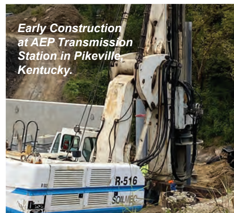
Early Construction at AEP Transmission Station in Pikeville, Kentucky.