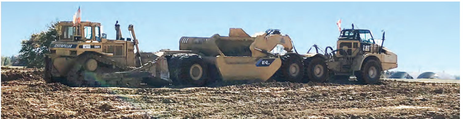
Beaty Construction on Highway 150 Slide project located on the Martin/Orange County line