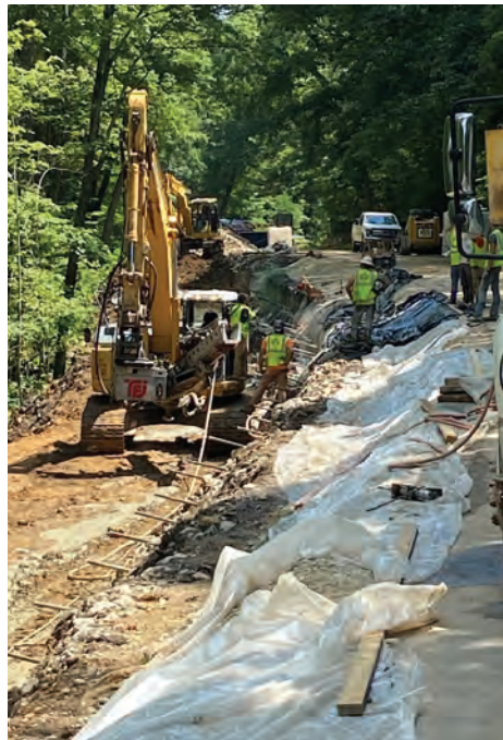
Weddle Bros. Highway Group on the Huntingburg Airport project in Dubois County

In closing, we would encourage everyone to attend the monthly district meetings held the first Tuesday of the month (Except for June and December) at 7:30pm. We would also like to remind everyone to make sure your certifications and drug cards are current. If we can be of any assistance, please feel free to call at 812-474-1811.