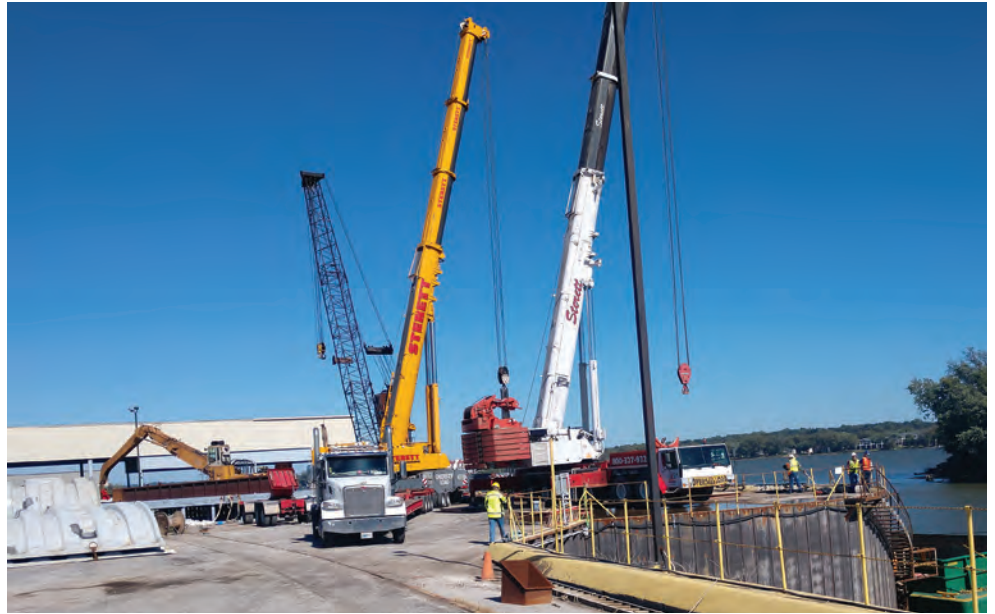
Sterett Crane at the port of Indiana in Clark County, Indiana

The District 3 office hopes and prays everyone throughout the local is healthy and safe. The year 2020 will go down in history as one of the most challenging years any of us have ever seen or known. One of the things we can take from it is we are considered essential workers and with that, we all should be extremely proud. At the start of 2020 mother nature was not very cooperative. A wet spring carried over into the summer and hindered several projects.