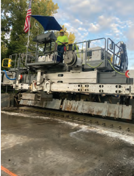
The Harper Company on Highway 60 in Wickliffe, Kentucky

Work has been steady throughout the year. Smith Contracting, LLC is finishing