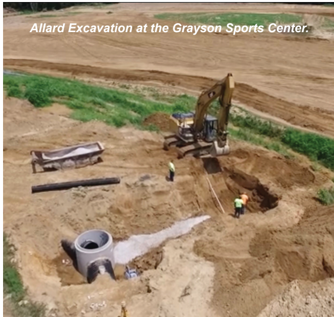
Allard Excavation at the Grayson Sports Center.