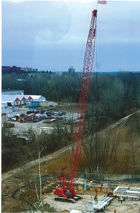
Kokosing on the Westside Treatment Plant expansion in Evansville, IN

At AEP Power Plant in Rockport we will have BMWV, UCCI and Skanska working with them on the SCR project and the DSI project as well at that site. More operators should be added in the coming weeks. Skanska also has some small furnace rebuild jobs at Alcoa.