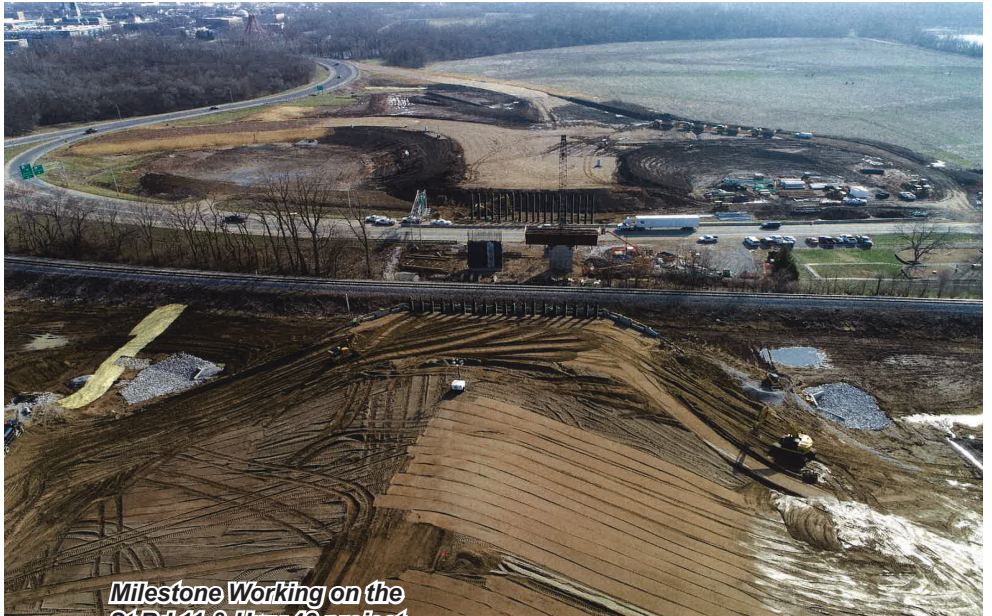
Milestone Working on the St Rd 11 & Hwy 46 project in Columbus, IN.

In closing we would like to remind all operating engineers to please be safe and follow all CDC guidelines concerning social distancing and personal hygiene. Please use all your PPE and look out for your fellow operators, working together we can overcome these tough times. ♦