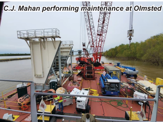
C.J. Mahan performing maintenance at Olmsted