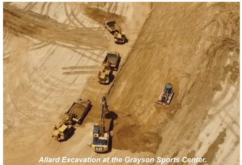
Allard Excavation at the Grayson Sports Center.