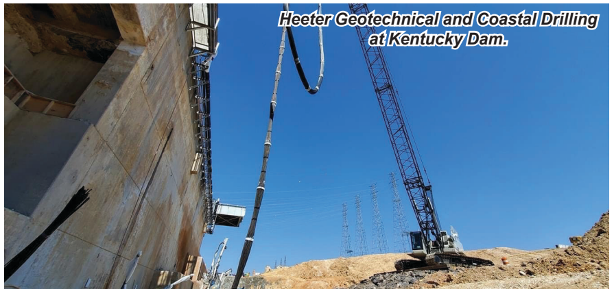
Heeter Geotechnical and Coastal Drilling at Kentucky Dam.