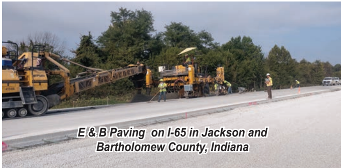
E & B Paving on I-65 in Jackson and Bartholomew County, Indiana

In closing, I want to encourage all members to attend the monthly District meetings held in Louisville, KY on the 1st Tuesday and Elrod, IN on the 2nd Tuesday of the month (except in June and December). If we can be of any assistance, please give us a call at (502) 636-1476. ♦