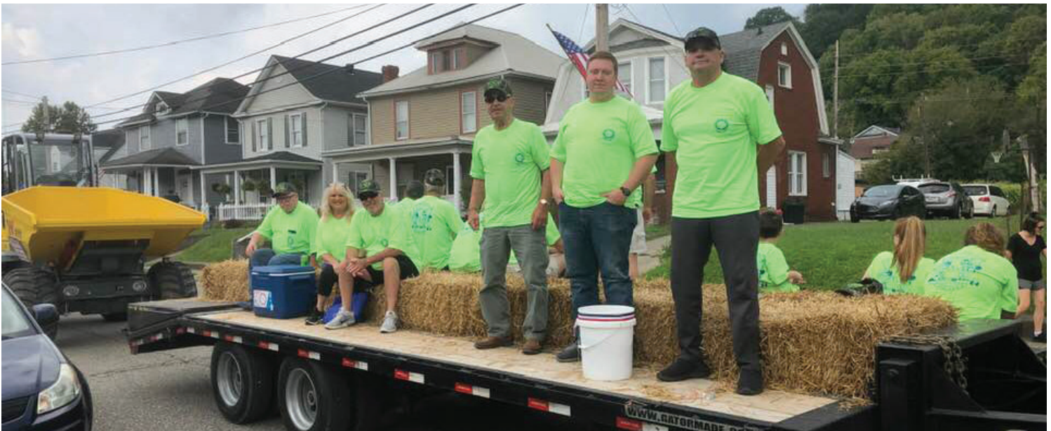
2019 Labor Day Parade