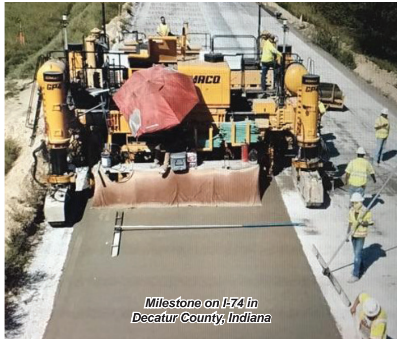
Milestone on I-74 in Decatur County, Indiana