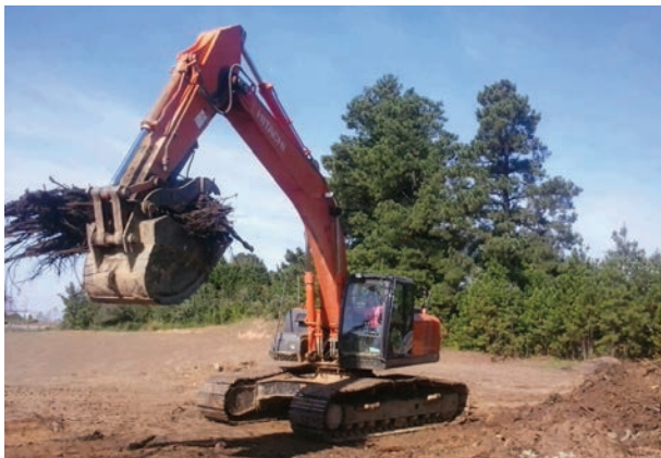
Parkway Const. on the US 41-A road widening and drainage project in Hopkins County, KY.

If we can be any assistance, please give us a call at 270-826-2704. ♦