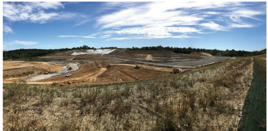
Hazex Construction on the Real Alloy Landfill Cell A & B in Butler County, KY.