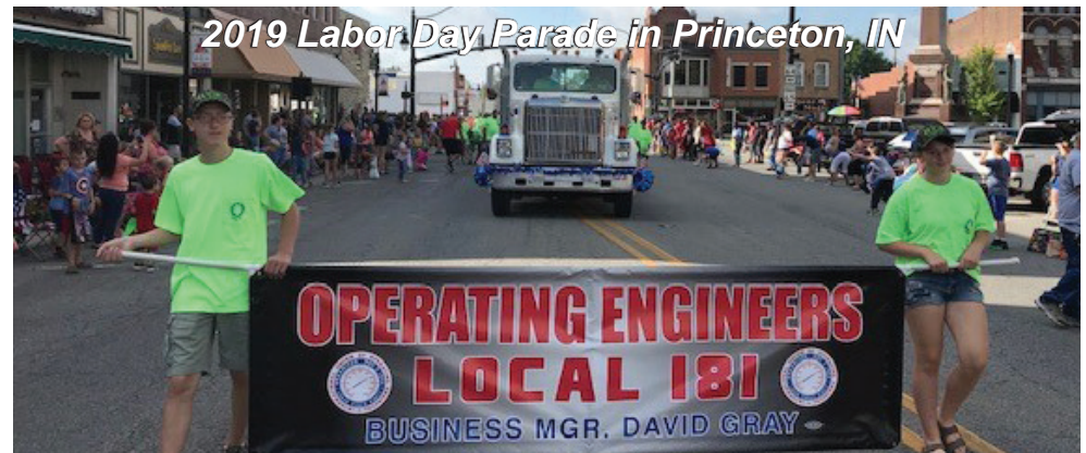
2019 Labor Day Parade in Princeton, IN