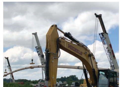
Michels Pipeline in Mercer County, Kentucky

In closing, attend your Union meetings and stay informed on your upcoming jobs. If we can assist you in any way, please call the Lexington office at 859-278-8458. ♦