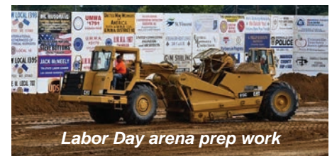
Labor Day arena prep work