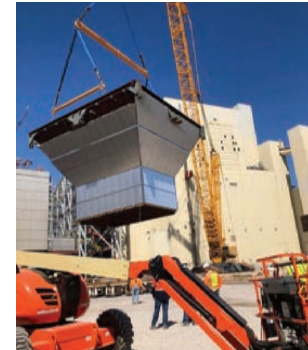
BMW Constructors on the scrubber project at AEP

If we can be of assistance, please call 812-474-1811.