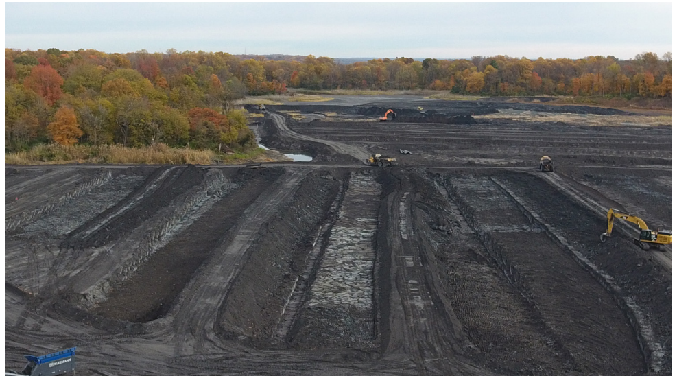
Blankenberger at AB Brown

Work in District Two has been very strong with a good mix of Heavy/Highway and Building work. Barring any major economic setbacks, work looks to continue strong into the next few years