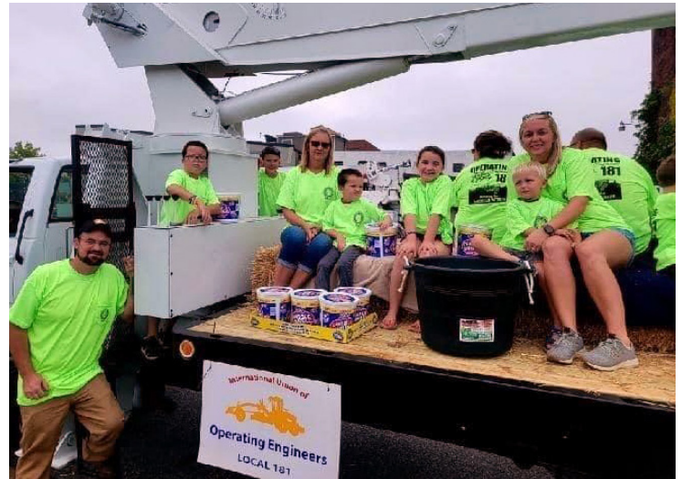
Labor Day 2022 picnic

In closing we want to encourage all members to attend the monthly meetings held the first Tuesday of every month (except June and December) at the AFL-CIO building located at 1202 South 4th street, Paducah, KY at 7:30 pm. The newsletter should be reaching our members in the Holiday season, so we want to wish everyone in District Five a Happy Holiday Season and Happy New Year!