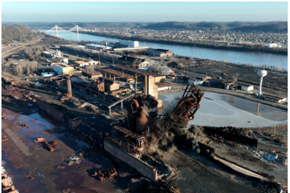
AK Steel Demolition

A special thanks to all who helped and participated in the Catlettsburg Labor Day Parade. Without your help it would not be possible. I would also like to thank all the members who keep turning out for the monthly Union Meeting. Keep coming back! I wish each and every member a happy and prosperous new year. If I can be of any assistance, feel free to stop by or call me at (606) 739-0067.