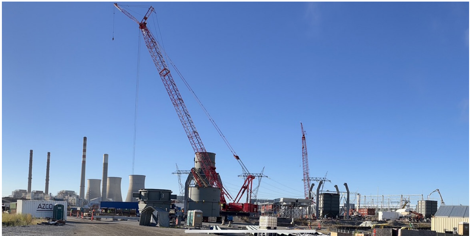
The simple cycle project at TVA in Muhlenberg County

If we can be of any assistance, please call us at 1-270-826-2704.