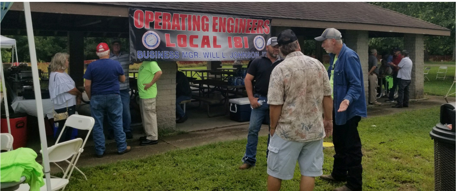
Labor Day Picnic Fort Boonesborough