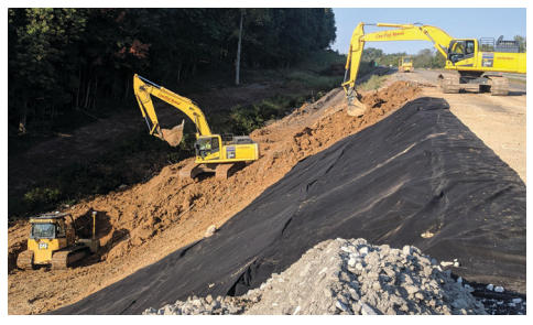
E & B Paving on the Bluegrass Parkway paving mainline in Hardin County, KY.