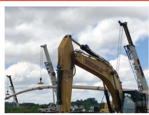
Michels Pipeline in Mercer County, Kentucky

In closing, attend your Union meetings and stay informed on your upcoming jobs. If we can assist you in any way, please call the Lexington office at 859-278-8458.