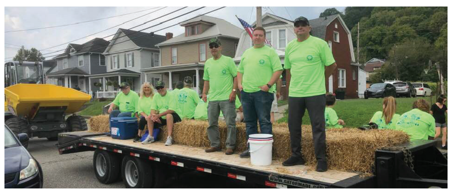
2019 Labor Day Parade